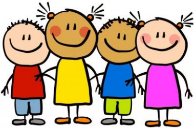
Kristina McKean, Director

K-3 one week of lunch = $14.25 4-12 one week of lunch = $15.25 K-3 one week of breakfast = $10.75 4-12 one week of breakfast = $10.75