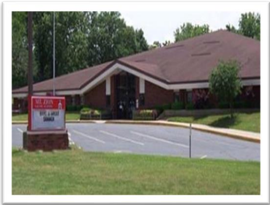
"Mt. Zion Grade Rocks!"

Mt. Zion Grade School continues the tradition of high quality education in a safe and nurturing environment. We appreciate your entrusting us with your child's education, and we certainly encourage the participation of parents and guardians in their child's education at both home and school. Open and honest communication serves each child best. Therefore, we will contact you if any concerns arise. Likewise, we ask that you feel free to contact us at 864-3631. We also enjoy visitors, so please plan to attend as many family events as possible, and please remember to sign in at the office as required. The staff of Mt. Zion Grade School looks forward to you and your child joining us. By working together, we can help ensure a productive and rewarding learning experience for all of the children at Mt. Zion Grade School!